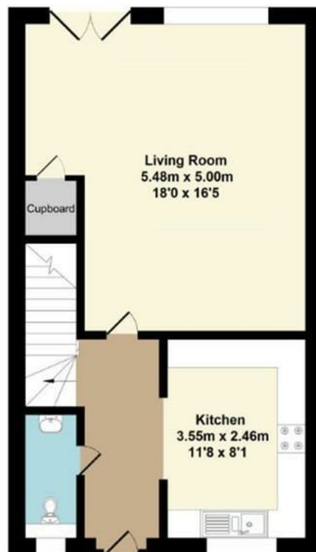
Ground Floor Approx. Floor Area 46.00 Sq.M. (496 Sq.Ft.)

Whilst every attempt has been made to ensure the accuracy of the floor plan contained here, measurements of doors, windows, rooms and any other items are approximate and no responsibility is taken for any error, omission, or mis-statement. This plan is for illustrative purposes only and should be used as such by any prospective purchaser. The services systems and appliance shown have not been tested and no guarantee as to their operability or efficiency can be given.